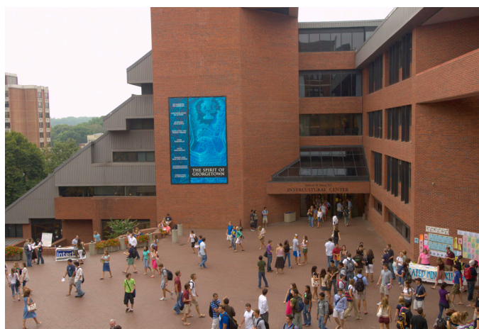
Bunn Intercultural Center (ICC)

Consultant, Georgetown Leadership Seminar, Institute for the Study of Diplomacy, School of Foreign Service, Georgetown University