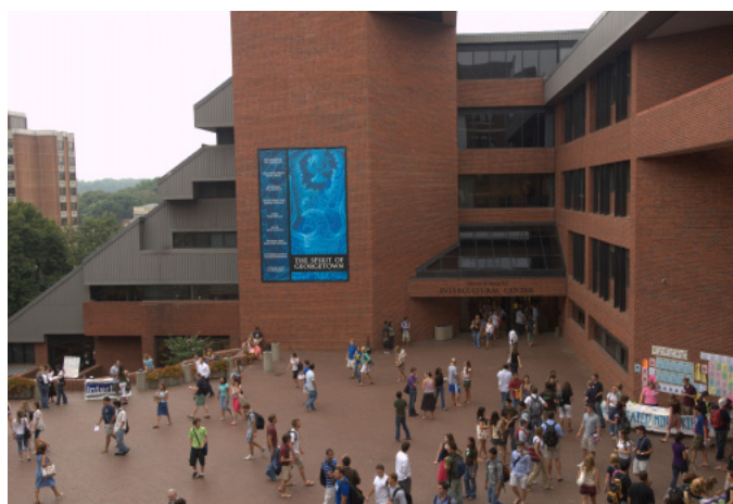
Bunn Intercultural Center (ICC)

Consultant, Georgetown Leadership Seminar, Institute for the Study of Diplomacy, School of Foreign Service, Georgetown University